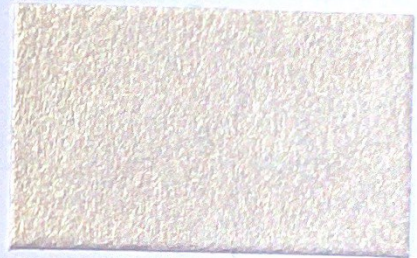
Golden White 106