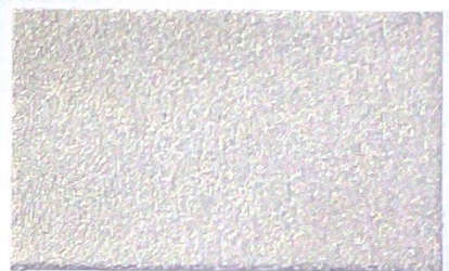
Golden White 116