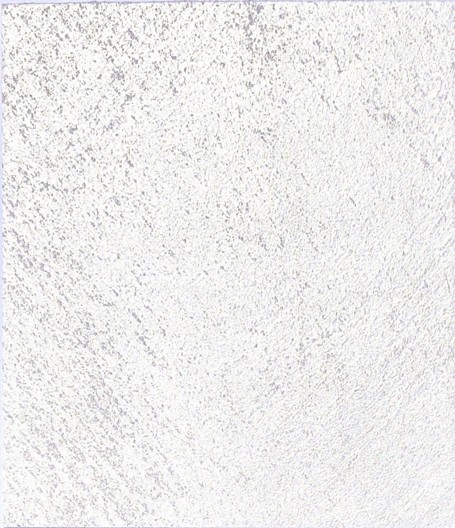
base Golden White